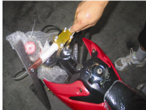
Step 3 Loosen the four bolts from up handle clamp.