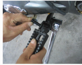
Step 16 Assemble the footrest and make sure the spring in correct way.