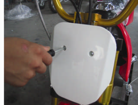
Step 9 Assemble the front cover and tighten.