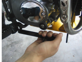
Step 18 Drew the foot brake little, make sure it under the adjust screws.