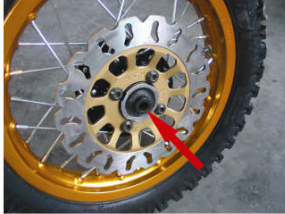
Step 12 Fit in the bushing (15mm) on the wheel.