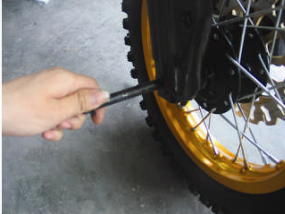
Step 13 Axle go throught the front fork and the bushing(24mm).