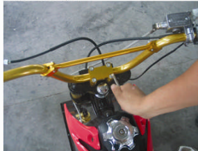
Step 5 Lid the clamp and tighten the bolts.