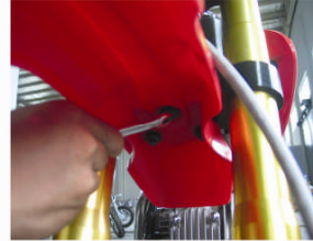
Step 7 Assemble the front fender on the steering stem.