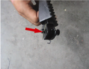
Step 15 Take the split pin off and draw out the pin in the left footrest.