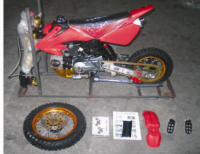
Step 2 Take off the steel frame