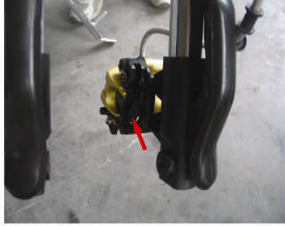
Step 11 Take out the rubber block.