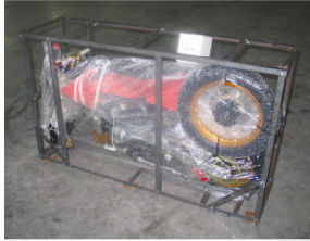
Step 1 Take out the Dirt bike from carton.