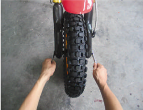
Step 14 Tighten the axle nuts nuts.