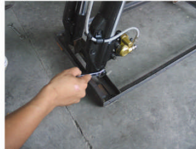
Step 10 Loosen and take out the axle nut between front fork and steel frame.