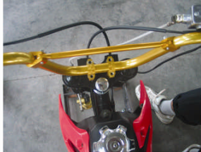
Step 4 Put on the handle bar on the down clamps.