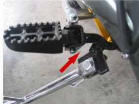
Step 17 Insert the split pin and cleft it. (another footrest is same way)