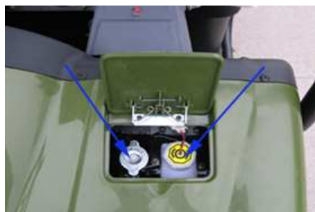
Fuel box cover (on the left side board)