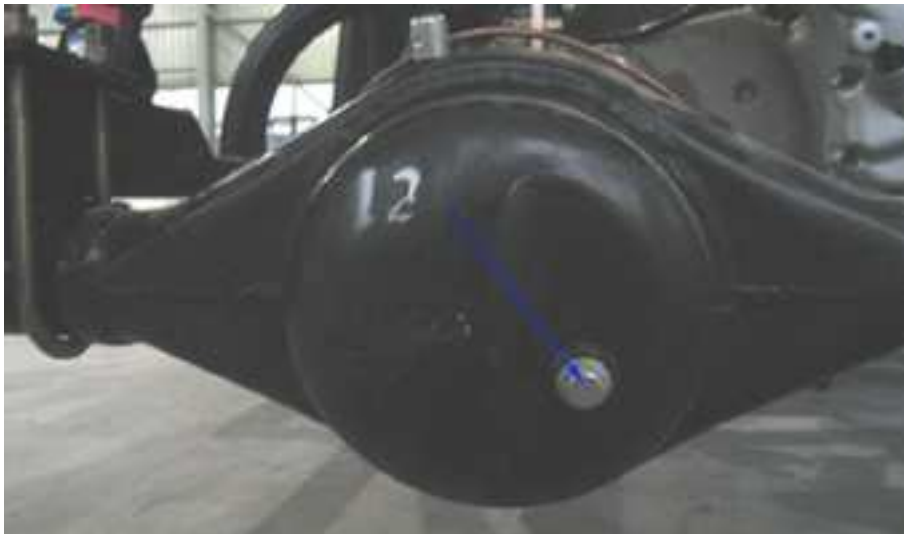
Oil checking hole of main reducer

Warning: Please fill up the brake liquid according to the stipulated trademark and type. Can not mix the different brake liquid from different makers. Keep the liquid level in proper position, otherwise will cause accident.