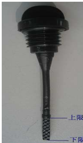
Engine and rear suspension