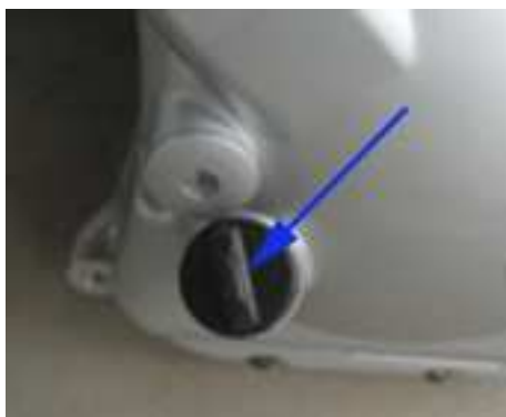
VIN code position