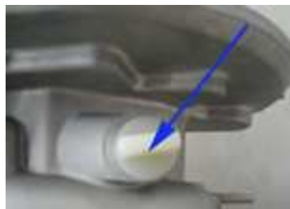
Oil drain plug of engine (under the engine)