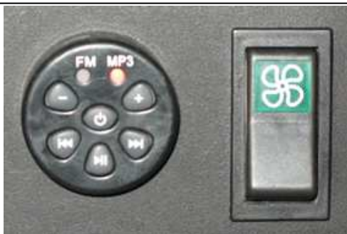
MP3 player and spare switch

Warning: Oil in main reducer should be filled by prescriptive trademark. Oil quantity in main reducer should equal to oil intake orifice ,over more will incur oil leakage, and over less will burn out main reducer.